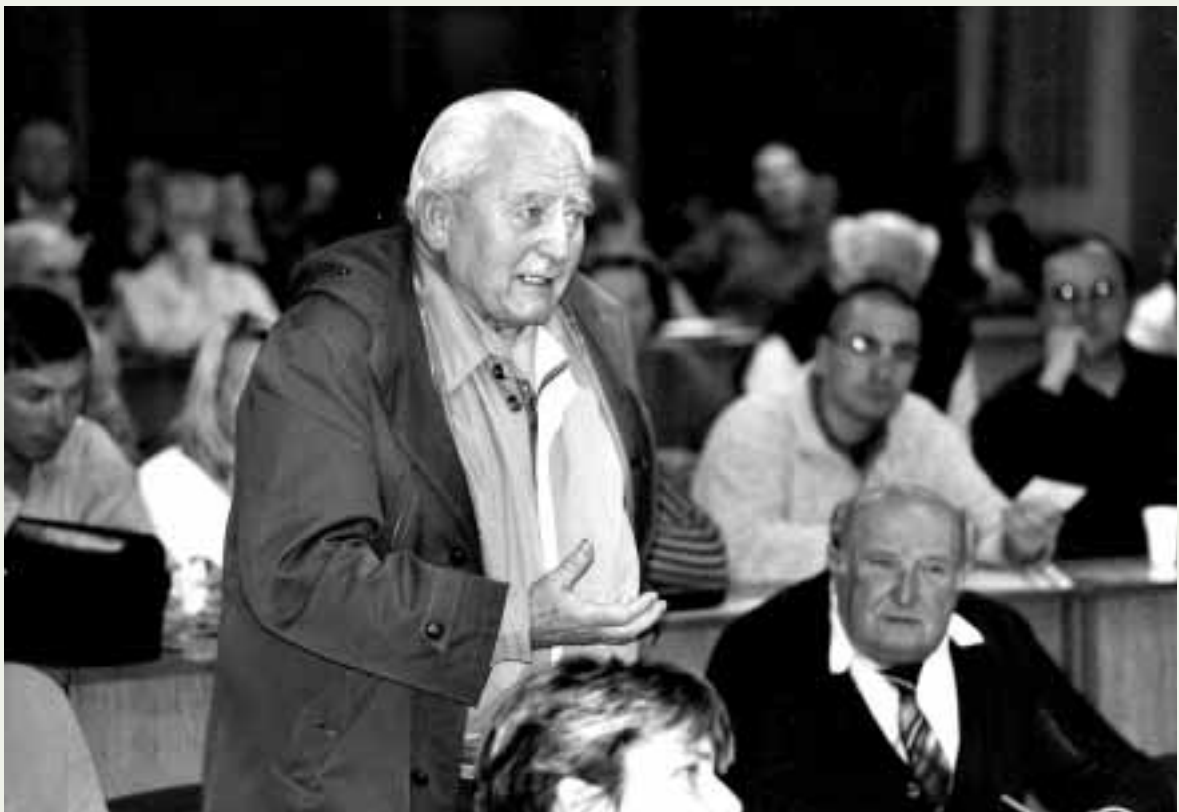
Public hearing hold in Tábor before local referendum