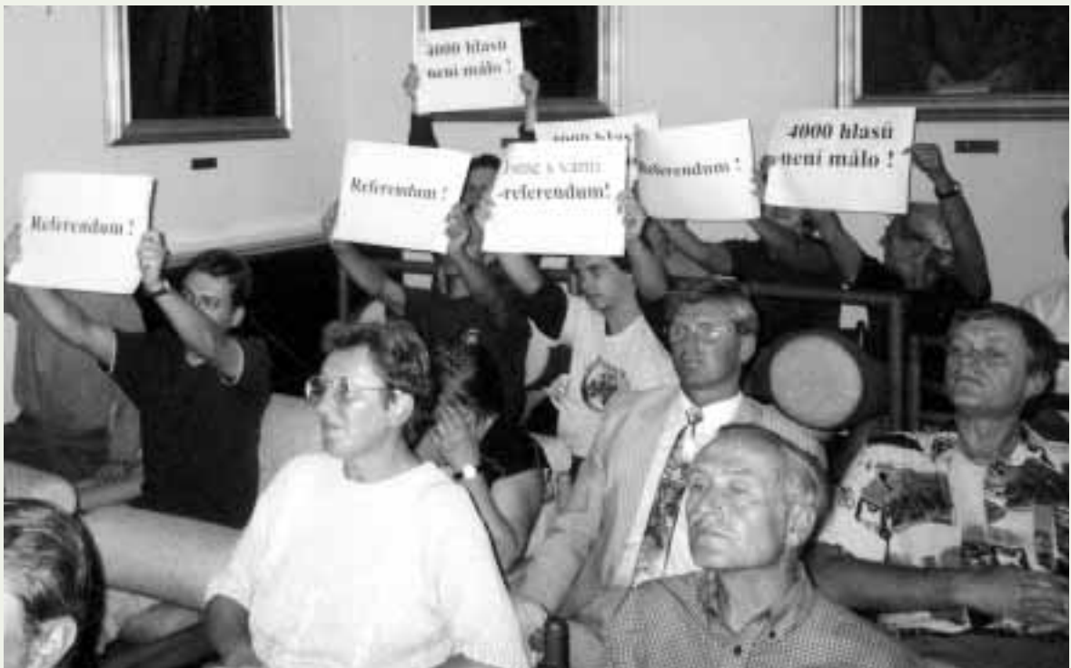
Foto: Supporters of local referendum at city council meeting

So then, what was year five like for EPS? Difficult, full of large projects, and last but not least, it was the year that saw our definitive division into a Tábor office and a Brno office. With two members of EPS moving from the Moravian capital to the heart of South Bohemia and with the acquisition of new staff for the Brno office, we have both expanded our staff and made EPS one of the strongest non-governmental organizations in its field.