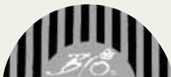
Label for organic products

At the company's behest, we led almost a half a year of negotiations with their legal representatives, trying to reach a peaceful settlement. We submitted a proposal for preliminary measures for the court to use in order to prevent the product from reaching the market. In the meantime, the court requested several times that we provide more evidence to supplement that in the original filing. The concrete result of the suit was the fact that (after the media pointed out the case), the Olma company in Olomouc turned to Kontrola ekologického zemědělství , an eco-agriculture quality-assurance company, requesting information on the conditions that must be met to obtain the BIO certificate. Within a quarter year later, they had brought a true Bio yogurt, named Dr. BIO, to market. We also began negotiating with Galas a. s. , the manufacturer of YOPLAIT BIO ACTIV yogurts, to convince them to withdraw their deceptively-packaged product from the market. The firm promised to take the product off the market within the year, and in the meantime, the new law on ecological agriculture, passed last year, came into effect and required to do, in essence, precisely that. Although the proceedings have not yet come to a close, we consider the Danone case to be precedential for the legal procedures used against multinationals that abuse their economic weight and compete in illegal ways with local producers.