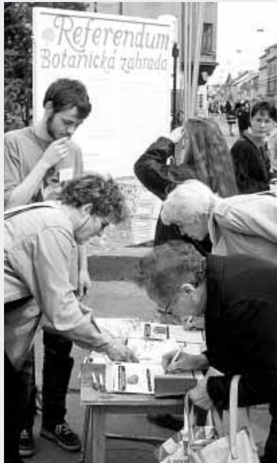
Foto: Gathering of signatures below a proposal for referendum

One special cause we undertook last year was not legal aid in the true sense of the phrase, but rather an independent campaign: successfully organizing the country's first local referendum on a city's environment, which took place in Tábor , South Bohemia. In this referendum, citizens were to vote for or against the planned construction of a road through the botanical gardens and down the Jordán levy, an ecologically and urbanistically extremely valuable part of the city's green space. With the help of other Tábor citizens, we composed the wording of the referendum questions, gathered over 3,000 signatures, organized a campaign to convince citizens to come to the referendum and vote against the construction of the road. Despite resistance from part of the city's representatives and the head of the District Office (the referendum was even temporarily illegally halted by the District Office), and unlike many preceding cases where bureaucrats managed to stop referenda through such steps (in Havířov and Ivančice ), the voting did finally take place, and citizens voted down the city's road construction plan by a nearly 80% majority.