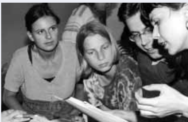
Foto: Participants of the Summer School of Human Rights

We try to write the magazine broadly understandable; as far as the subject matter, we focus generally on the legal protection of human rights and the environment, and specifically on the unfair and unlawful actions of public offices towards citizens, on access to justice and courts’ decisions in public interest law cases, on court reviews of the legality of administrative decisions (weakness in the administrative-court system), on cases where public offices illegally refuse to offer citizens information, on proposed laws and amendments of existing laws, and on like matters.