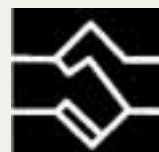
German Marshall Fund