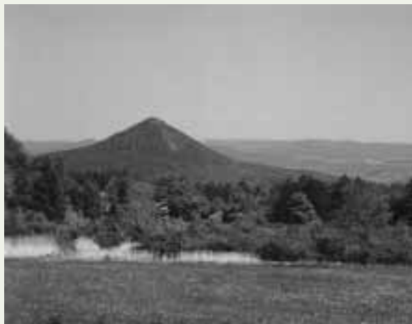
Foto: The protected area České středohoří

For two years now, we have been offering all needed legal aid to the civic association Děti Země (Children of the Earth) for their attempt to promote the more eco-friendly variants for the path of the D8 highway through the České Středohoří CHKO ("protected landscape area," a specific, legally-defined type of preserve) and the Krušné hory "nature park" (another legally-defined category). Due to the current political situation, where accelerated construction of highways is idolized by nearly all political parties, neither legal nor practical arguments have, for