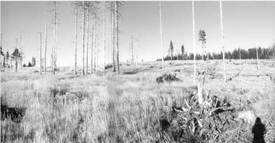
Foto: Clearcut in the Šumava National Park II.

We filed suit in the name of ČSOP Veverka , a local branch of the national nature protection association, who had been illegally refused information on the municipal budget. Our aim here is to answer the following question: if we submit an appeal against a "fictitious decision to refuse information" (see above), and then the mayor, who by the way in this case is authorized to act both as the authority of first instance and as the appeals authority (!), writes that he will not provide us the requested information, without mentioning an appeal, what kind of document do we now hold? An appeals decision, or "just" a decision of the authority of first instance? This case is evidence of the absurd legal traps into which a citizen can fall during the application of the Right-to-Information Act.