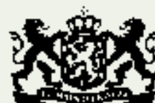
The Netherlands Embassy

© Environmental Law Service, 2001 www.i-eps.cz