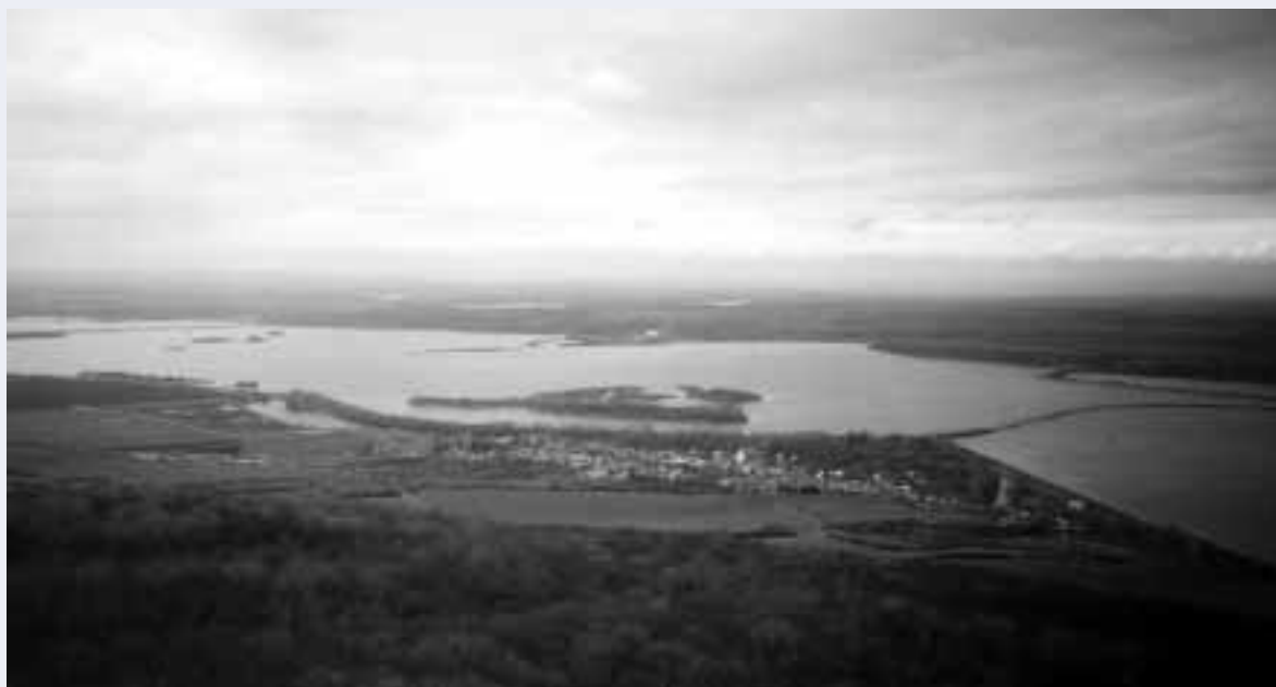
Foto: Novomlýnske reservoirs

Česká inspekce životního prostředí , the Czech environmental-monitoring government agency, at the Ministry of Environment's behest. The District Office and the Inspekce both issued preliminary corrective measures in the middle of last year; these were supposed to temporarily define the water level. The District Office ordered the firm to raise the water; in reaction to this, the Inspekce issued a preliminary measure to do the opposite – to