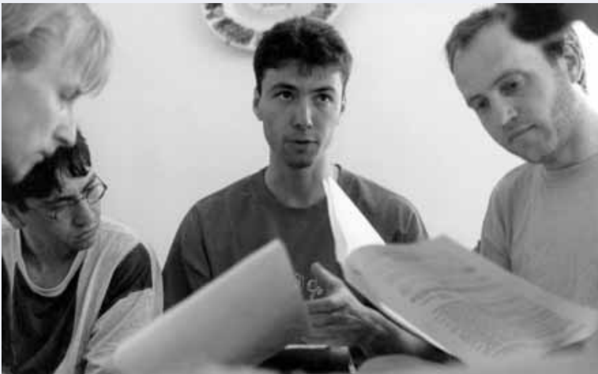
Foto: Participants of the School of Public Participation