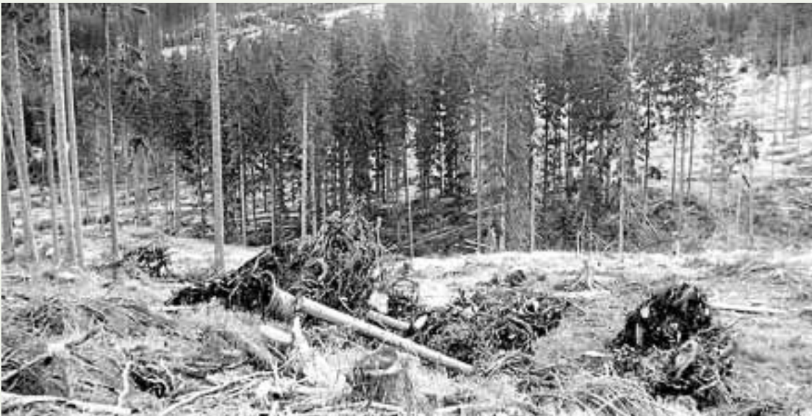
Foto: Clearcut in the Šumava National Park I.

At the same time, the "Šumava" case is a sad reflection of the state of the Czech administrative courts. EPS has been a participant in administrative proceedings on the permission to log in all zones of the park. We have submitted two administrative suits, and against the decision by the High Court in Prague, which refused to deal with Hnutí DUHA's suit against the decision of the Minister of Environment, we even submitted a constitutional complaint. Because the Constitutional Court also refused to handle the matter, even though this is, in our opi-