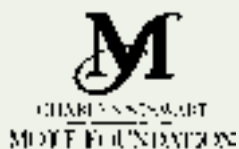
C. S. MOTT Foundation